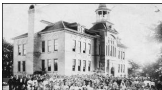
Excelsior Public School

HOURS: 10 am-1 pm, Wednesdays and the second Saturday of the month, or by appointment.