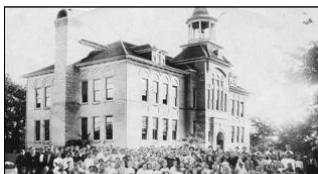
Historic Excelsior Public School

The Society's Archives hold local historic records including photographs, maps, newspapers, historical Excelsior vital records and other materials of special interest to genealogists and those researching building and house history in the area.