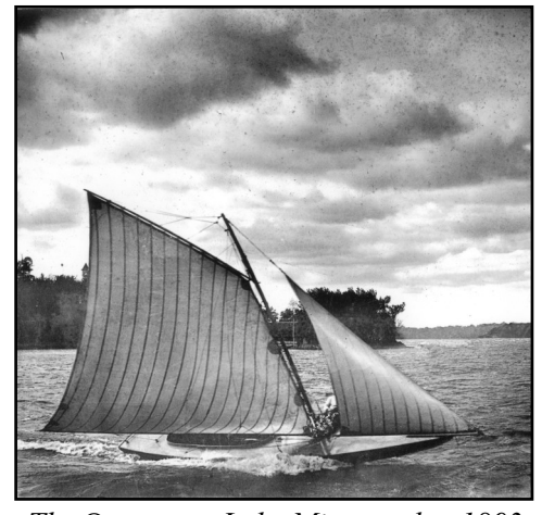
The Onawa on Lake Minnetonka, 1893.