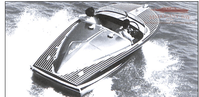
1955 18' Chris Craft Cobra