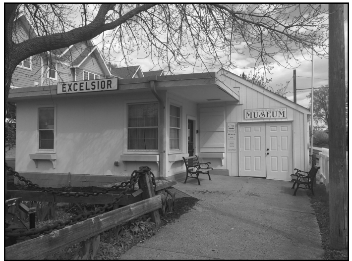
Our Museum at 305 Water Street, Excelsior features artifacts from the Excelsior Amusement Park, Lake Minnetonka nautical life, tourism and Excelsior's civic and commercial past.

But we also hope you'll help us keep the Museum open by signing up to volunteer as a Museum Host. Duties include opening and/or closing the Museum, greeting the public, selling books and answering simple questions. No experience is necessary and simple training is provided. Sign up for one or multiple shifts on Tuesdays, 2-6pm and Saturdays, 10am-1pm and 1pm-4pm throughout the summer. To sign up visit www.elmhs.org/museum.html . Contact us at info@elmhs.org or 952-221-4766 for more information.