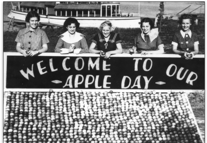
Apple Day Apple Queen and her court, 1935