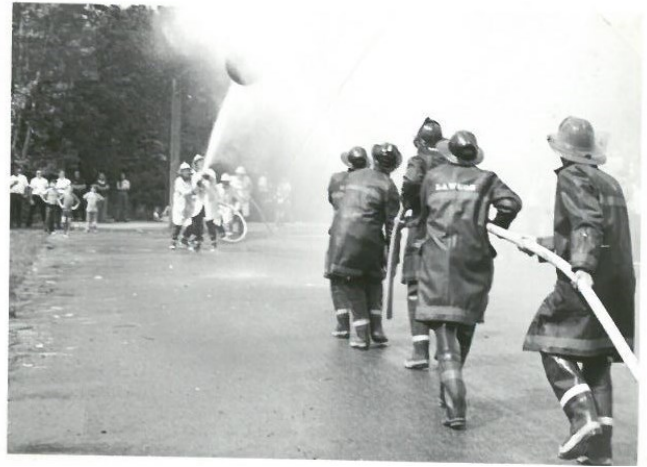
Fire Department Water Fight

The day's festivities will end with a water fight competition in the East parking lot in Excelsior. Water fights are unique to the fire service and were held so firefighters could