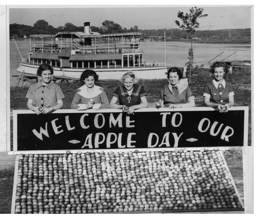
Apple Day 1935

In 1878 the Minnesota Legislature appropriated $2000 to purchase 116 acres of land adjacent to Peter Gideon's farm as a fruit breeding initiative for the University of Minnesota. The colorful and often controversial Gideon was named superintendent of the State Experimental Fruit Farm and he received a small stipend. As superintendent, Gideon planted thousands of trees and introduced several new varieties of apples. Gideon had a reputation for being a man of strong religious beliefs and political views. He supported women's rights, and the prohibition of alcohol and he condemned slavery, abuse of Indians and horse racing. As a result, he was often at odds with the horticultural community and University administrators.