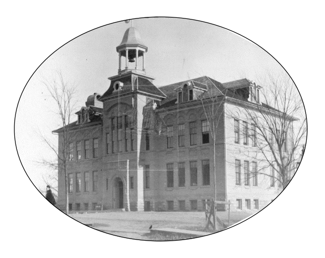
The archives are housed in the Excelsior Public School Building in Excelsior.

Can you help? The Society is looking for long-term volunteers to take shifts on Saturdays and/or