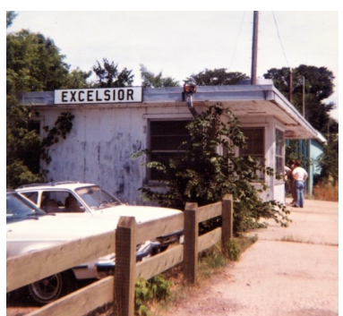
Future ELMHS Museum, 1982

Society and the Excelsior-Lake Minnetonka Historical Society Museum opened to the public with a historical toy display in December 1983. In 1986, an addition to house the historic sailboat Onawa was built, and an Excelsior Amusement Park ticket booth was