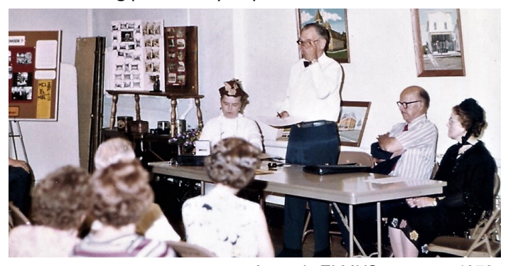
An early ELMHS program, 1972

And finally, after being awarded a Heritage Partnership Grant from the Minnesota Historical Society in 2020, the Society has begun an exploration of strategic alignment options with four other historical societies guided by an experienced non-profit organization consultant. This initiative is still underway, and the participants are excited to be working proactively to preserve our shared