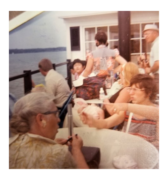
1973 "Lady of the Lake" History Cruise

Topics and tick information will be available the month prior to each cruise at <a href="mailto:elmhs1.eventbrite.com">elmhs1.eventbrite.com</a>.