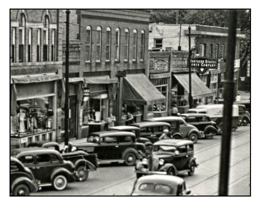
Water Street in Excelsior, 1937.

We want your memories! Log on to Facebook or Instagram every Wednesday to see a mystery historic building or event from Water Street. Write your guess in the comments section along with any memories you have that pertain to that building, place, or event. The answers for the mystery image will be posted the following week along with a new image for the current week. The memories that are shared will be collected and preserved for future generations.