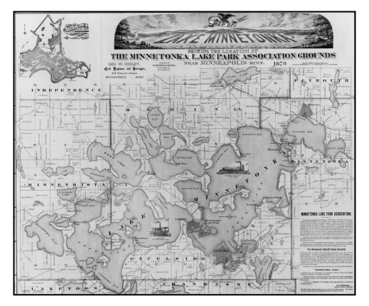
Map of Lake Minnetonka showing Minnetonka Lake Park Association Grounds, 1879.

The ELMHS is proud to announce two new historical tours of Lake Minnetonka created in partnership with Deephaven, Minnetonka, Wayzata and Westonka historical societies as well as the Museum of Lake Minnetonka. The tours use two Google Platforms; Earth and My Maps for virtual tours that will take you around the lake to experience the greatest hits of Lake Minnetonka area history from your home, bike or car. The tours include perspectives and images of these sites that you've likely never seen before, all curated by our fellow historians around the lake. The tours are completely FREE and will be available June 5. Access the tours via our website at elmhs.org/virtualtours.