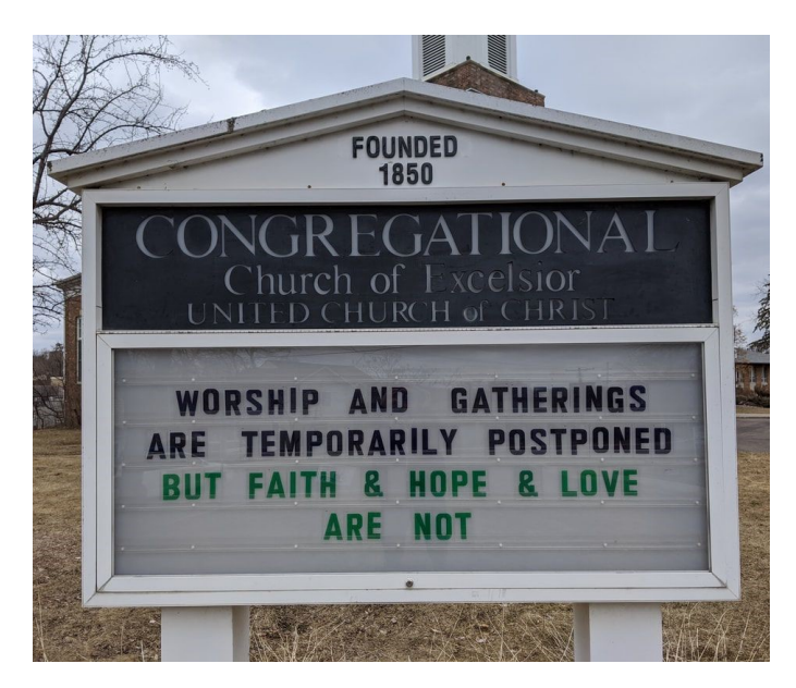
Inspirational message on the School Avenue sign for the Congregational Church of Excelsior, 2020.

Help us save history by saving and submitting your stories or artifacts. For more information or to submit your stories email us at <u>info@elmhs.org</u> or visit our website <u>www.elmhs.org</u>. You can also submit material via mail to P.O. Box 305 Excelsior, MN 55331.